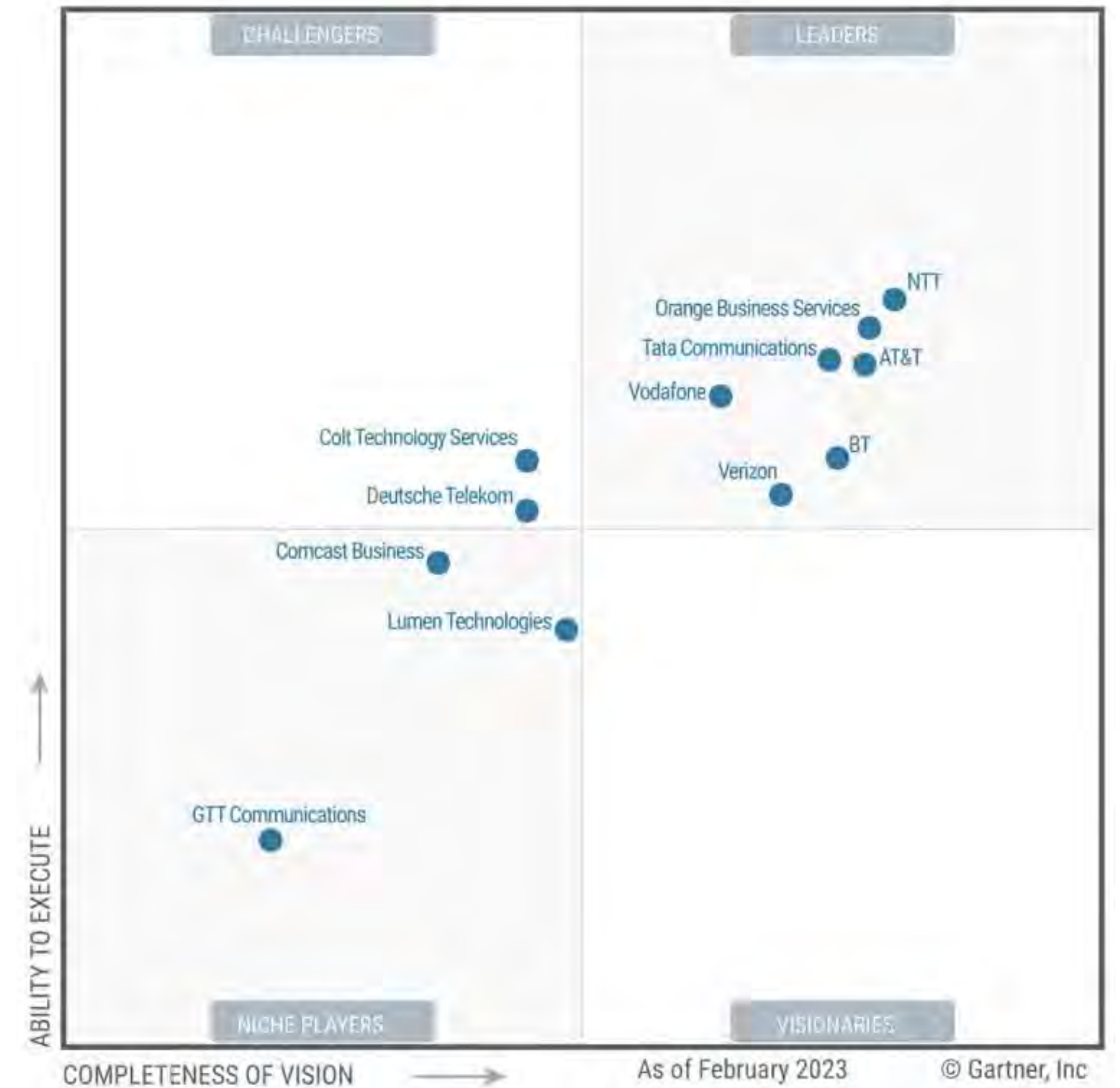
Figure 1: Magic Quadrant for Network Services, Global

The report 'Magic Quadrant for Network Services, Global' was previously titled as Magic Quadrant for Global Network Service Providers (2012-2014)